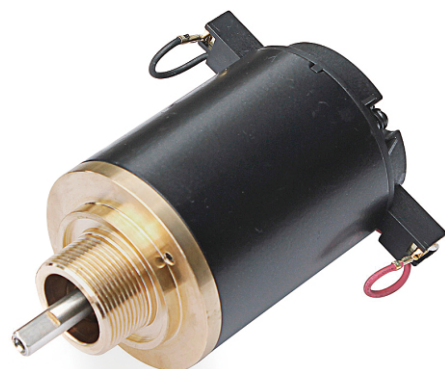
清洗电机 / DZ63ZY Cleaning Motor